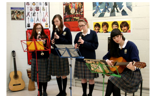
Music in Presentation Community College

We challenge our students to push themselves to achieve their potential in all aspects of school life.